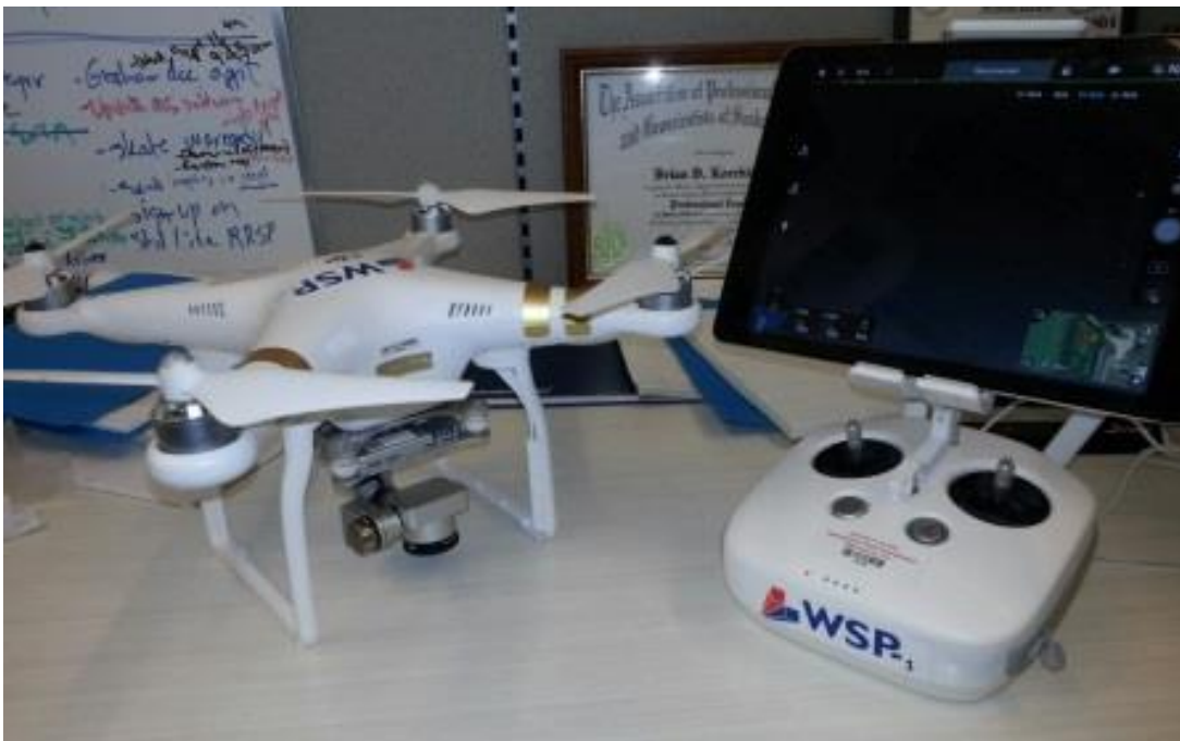
My reconnaissance tool of choice...a DJI Phantom 3 quadcopter