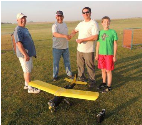
Another "A" wings graduate.