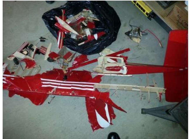
Close-up of what is left...

Typical Greg, all smiles in-spite of the carnage. A true veteran of many crashed airplanes. This is worth 10 points, Art..!